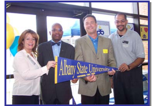
Albany – Chamber members were treated to a pep rally for the August Business After Hours.

The 2009 Fall Festival and Fair will take place November 3-7 and is set to be bigger and better this year featuring new rides, more kids’ activities, and even some racing pigs!