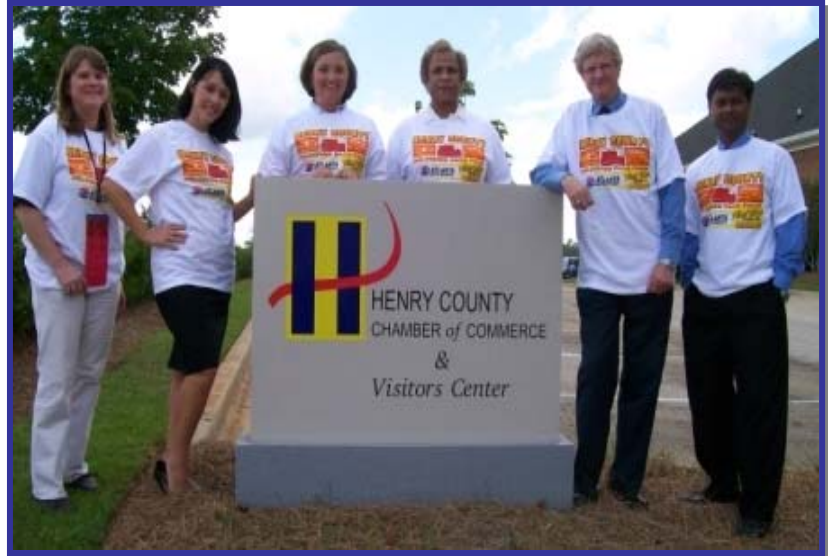
Henry County – Chamber members model the “First Time Under the Lights” commemorative t-shirts the Chamber/CVB is selling for the Labor Day Weekend race at AMS.

I was told a long time ago that luck is defined as when opportunity and preparation meet. We can make our own luck by being a keen observer of what is happening around us. Our role places us in a unique position to spot opportunities and facilitate coalitions. The art lies in spotting the opportunity, articulating it, generating the buy-in, and supporting the implementation. When you can pull this off, you and your Chamber will be key players in your community.