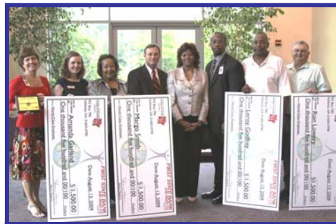
Valdosta – Checks were given out at the World Class Recognition Early Bird Breakfast.