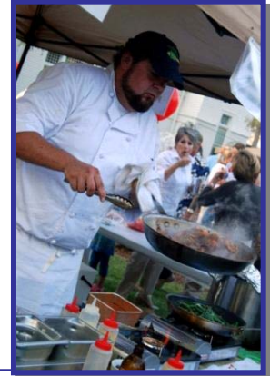
Eatonton – The 10 th Annual Taste of Eatonton will take place in October – yum!

Good Morning Macon was also held in August with 150 Chamber Members attending at the Douglass Theatre downtown to eat a continental breakfast and listen to US Congressman Jim Marshall deliver a Federal Update from Washington DC.