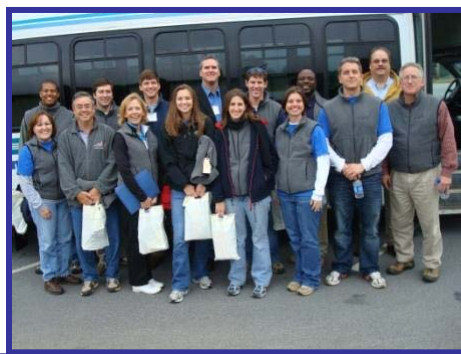
Carroll – Project Managers visit Carroll County to learn more about the county's industrial opportunities.