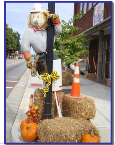
Thomson – Georgia Power participated in the Chamber's "Fall Crow" contest.

The Chamber hosted a 5 Night New England & Canada Cruise in October. The group set sail from Boston, MA on Royal Caribbean Cruise Line's "Jewel of the Seas." The ship cruised to Portland and Bar Harbor, Maine; and Halifax, Nova Scotia. The group of approximately 40 people was comprised of many long-time residents of Paulding County.