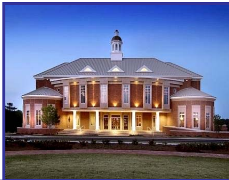
Henry County – Stockbridge unveiled its new City Hall at an open house and ribbon cutting ceremony in October.