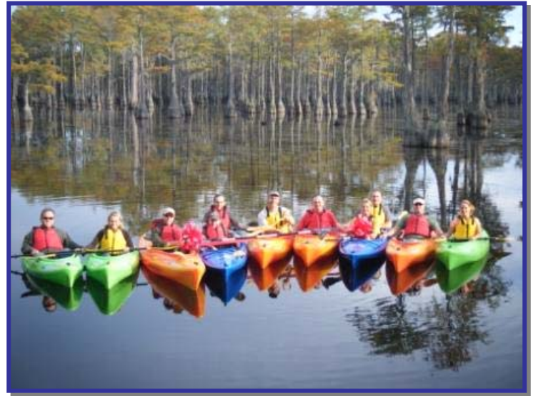
Swainsboro – The Chamber recently conducted an unusual ribbon cutting for a new member - Mill Pond Kayak, LLC.

So what does this have to do with Chamber work? Sometimes we are faced with challenges that are colored with preconceived notions (such as girls don't play football). If we react based on these perceptions then we miss the opportunity to make a better decision. It is also important to remember that we don't always have all the