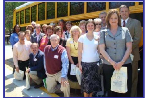
Carroll County – The Chamber recently hosted the 2 nd Annual Business & Education Bus Tour.

For the third year, Emerge Albany and The Albany Herald have teamed up to host a luncheon to pay tribute to