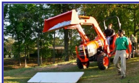
Milledgeville – The Chamber's golf tournament closed with the ceremonious golf ball drop where someone won $2,000.

The Chamber will host the Taste of Ellijay on May 27. The event will be a unique culinary experience in historic downtown Ellijay.