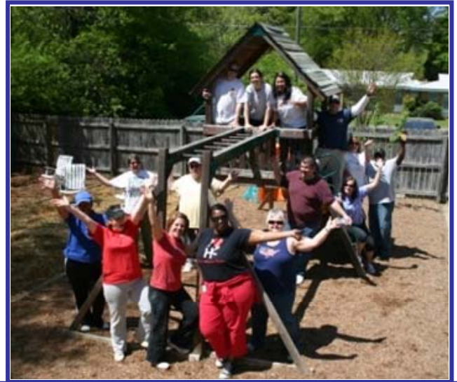
Douglas County – The Chamber's Leadership Class of 2010 helped complete the S.H.A.R.E. House in Douglasville.

Regardless of the stage of your career, GACCE can benefit you. If you are in the early phase of your career, get engaged – establish a network of peers with whom you can vet your challenges and seek ideas. Find a mentor whom you can use as a sounding board. If you have a few years under your belt, volunteer to serve on a panel, facilitate a