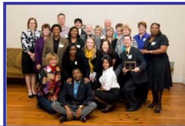
Eatonton – The Chamber graduated its 15 th Leadership Putnam class.

The Chamber's 10 th Annual Golf Classic will take place May 11 at Chateau Élan.