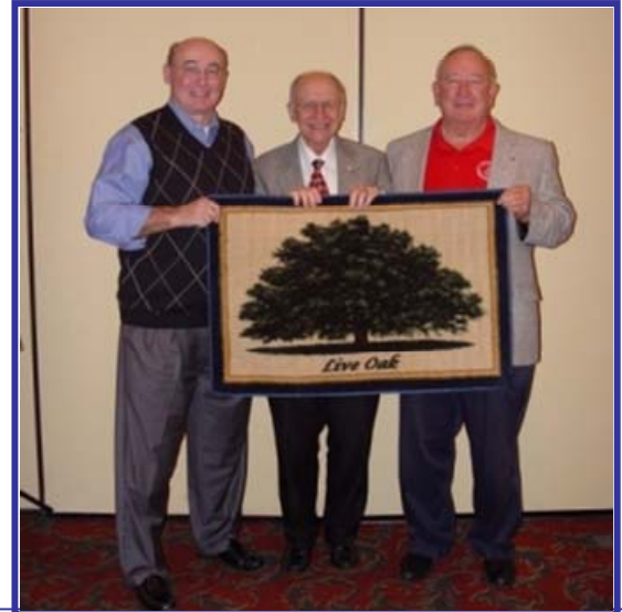
Dalton – Pictured are members of the legislative delegation that represent Whitfield County holding this year’s commemorative rug.

I encourage you to attend the Staff Clinic on March 16-18 th in Douglasville. Also, I ask that you please share your successes and failures in the Social Media arena