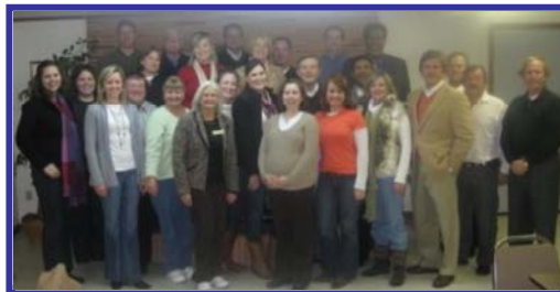
Swainsboro – The Chamber recently hosted Georgia's Tourism Representatives in Emanuel County.